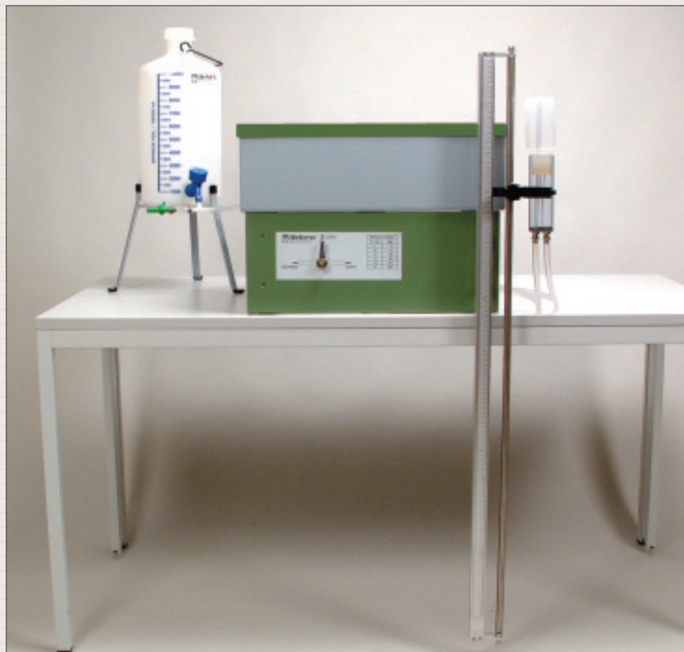
Sandbox for pF-determination (pF 0 - 2.0)